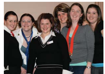
Members of the Goldfields Rotaract Club

The Goldfields Rotaractors recently celebrated their changeover with a Back-to-School theme.